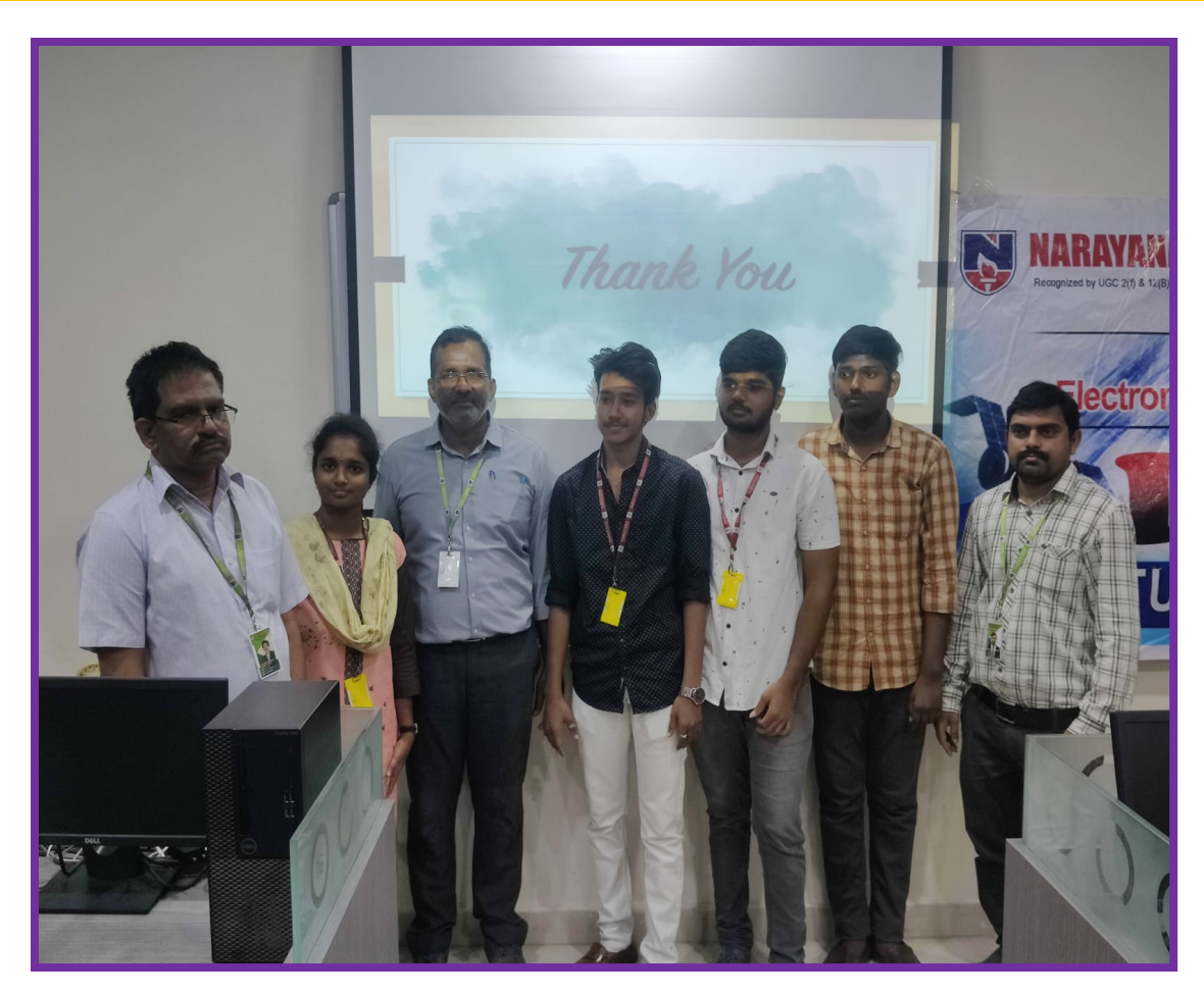
Winners List of Technical Quiz